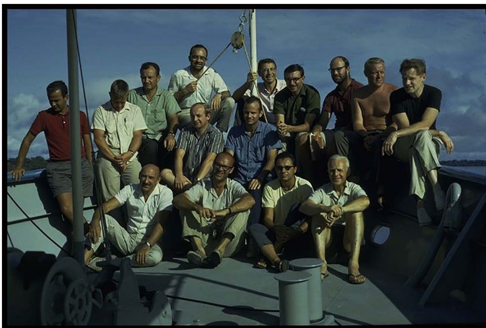
Fig. 3. Researchers and crew of the 1967 Alpha Helix Expedition to the Amazon.